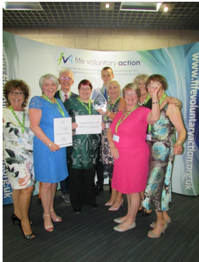
The penultimate Award of the evening was Organisation of the Year, which was won by Glenrothes Foodbank. Pictured with their award are the team from the Foodbank.